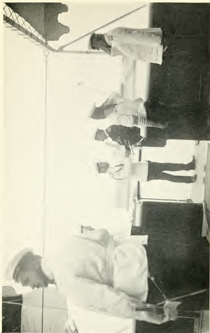
The two Emperors taking leave.